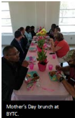
Mother's Day brunch at BYTC.

The women and some of the men showed their support by ensuring no food went to waste; they thoroughly enjoyed the wonderful gesture! In addition to the food, each Mother received a flower courtesy of Youth Opportunity Investments, corporate.