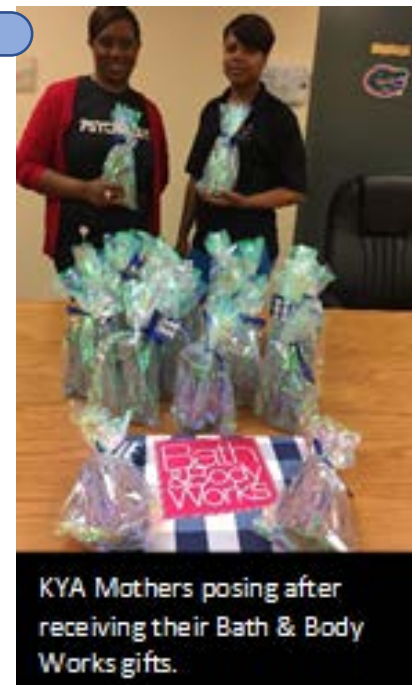
KYA Mothers posing after receiving their Bath & Body Works gifts.

YOI and its leadership team has made the Morale Committee a priority in its programs. The Morale Committee is not just an event planning committee or a random place to vent. It serves as an opportunity for staff to be an integral part of program planning and implementation. It’s a strategic initiative that has been placed into policy to ensure action. The Morale Committees of YOI has a vision, serves as a place for information gathering and information sharing, has a budget and has the support of program administration. As a result, happier staff leads to happier kids; the proverbial win-win.