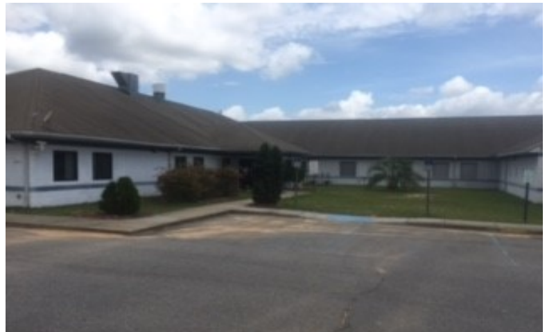
Crestview Youth Academy A Center for Success and Independence

Youth Opportunity welcomes another campus to the Youth Opportunity Family of Companies, beginning August 1, 2017. The 54-bed facility in Crestview, FL will be called Crestview Youth Academy, "A Center for Success and Independence." Join us in welcoming the staff!